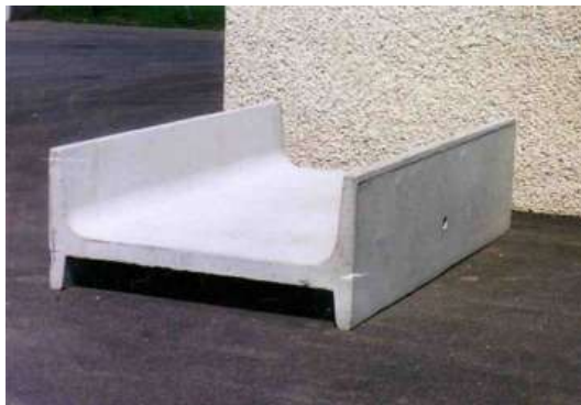
16" Bunk Pictured above

We recommend the bunk be placed on a 6" thick slab that is at least 84" wide. The bunk should be centered on the slab with at least 12" on either side of the bunk.